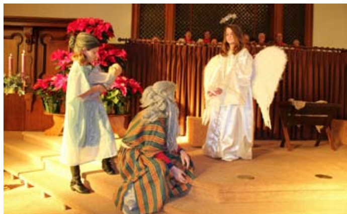
Youth act out parts in an "instant" Christmas pageant in worship on Sunday, December 23.