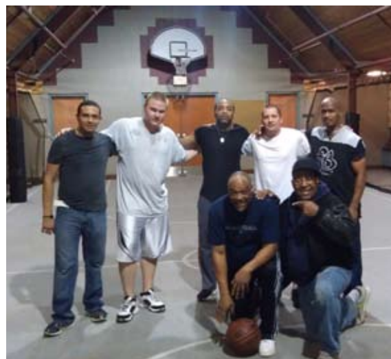
Group of guys from a local mission use our gym regularly to play basketball.

Elder Miller placed in nomination the following names for Congregational