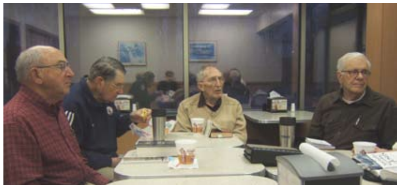
Men's Bible Study.

While some groups may complete their purposes and close, some plan to contin- ue in 2013. We hope new groups will form and new leaders emerge in 2013.