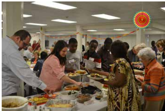
An International potluck was one of the many activities during Mission Week.

projects. We restated our commitment and focus on mission and developed a motto and value statement. These will guide our mission efforts for the next 3-5 years.