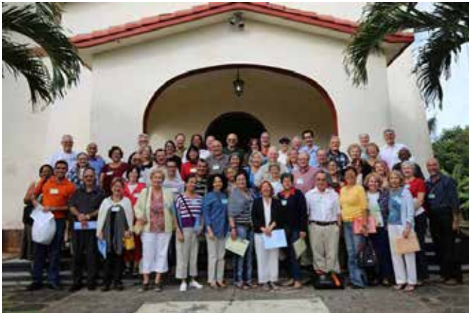
Members of our sister church in Luyana, Cuba with some of our Mission members.