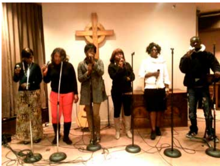
The Elect of God provide music each week for the Saturday evening Praise and Prayer Gathering.

Nearly all programs in the church were below budget. As a result of the restrained spending and the strong revenues, there was a year-end net balance of $70,514.